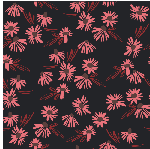
New Dazzy Daze

In some cases, your selected print will have more colours than the number of plain colours you chose to work with. If you have more than your main colours, let your imagination go wild and add some other colours that blend well.