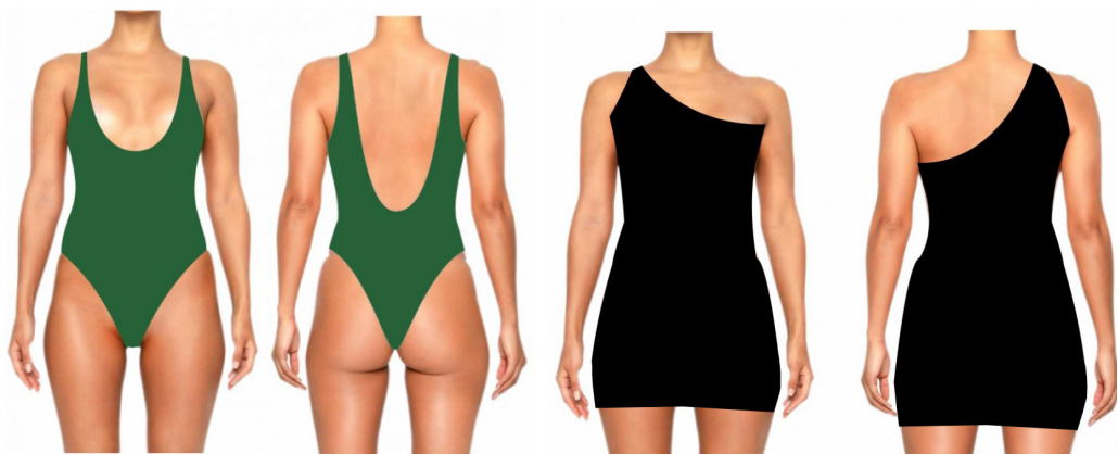
Reclaim Prime (Dark Forest)