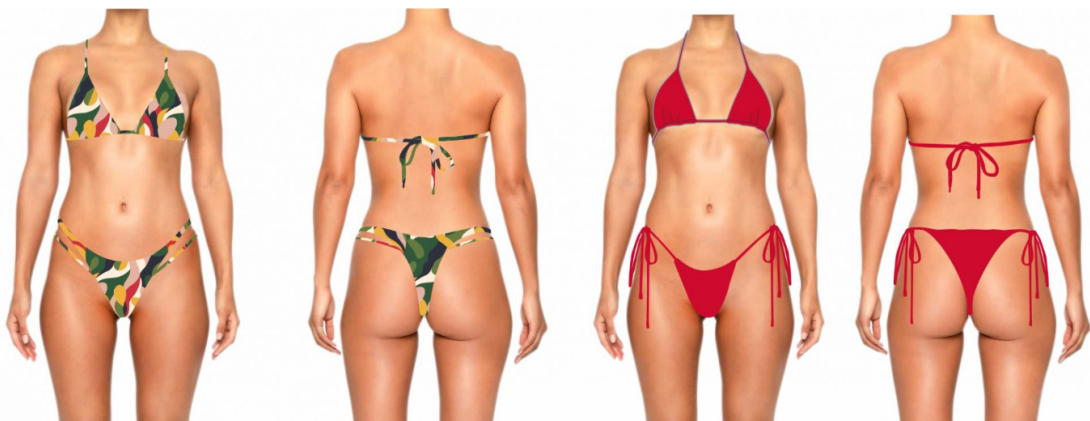
REPREVE Hawaii (Colorfull Abstract)