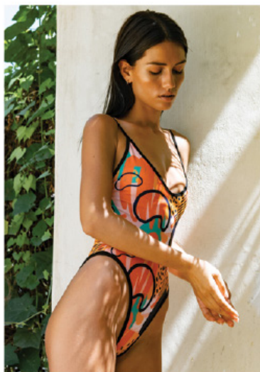
REPREVE® Digital print