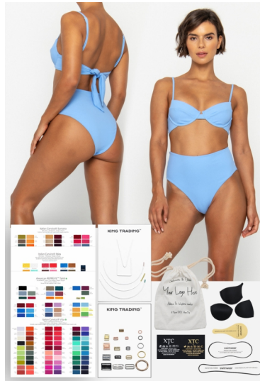
Maui Bikini Set