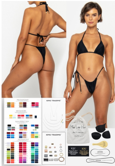
Kaia Bikini Set