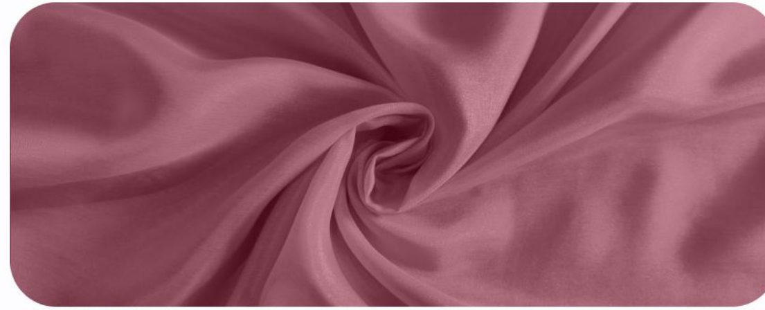
Silk Habotai: 100% Silk.

Versatile, lightweight blend with a comfortable weave. Semi-sheer nature and affordable pricing. Suitable for a wide range of garments, from casual to elegant styles.