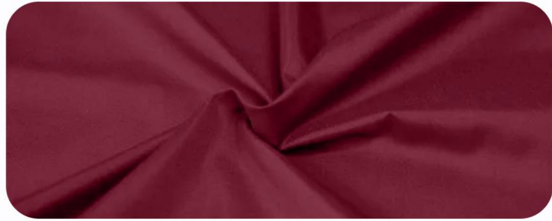
Silk Cotton: 65% Cotton, 35% Silk.

From the feather-soft Silk Habotai to the luxuriously sheened Silk Satin, we have a fabric for every design you can dream up. Need something versatile and budget-friendly? Our Silk Cotton Blend might be just the ticket. Looking for something sleek and body-hugging for evening wear? Try our Silk Stretch Satin.