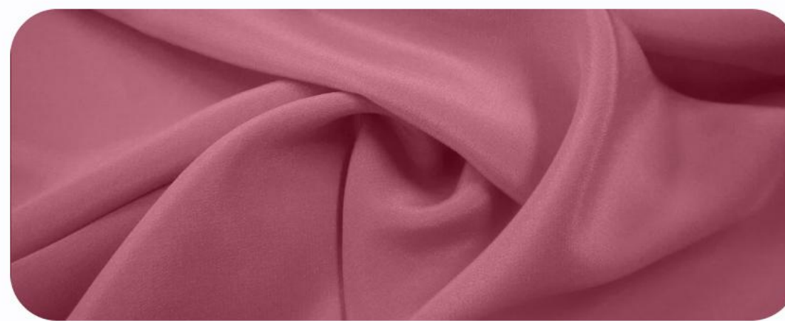
Silk Crepe de Chine: 100% Silk.

Elegant, ultra-sheer fabric with a soft, beautiful drape. Features a crepe-like texture and takes dyes exceptionally well. Ideal for summer wear and outdoor events due to its airy, breathable nature.