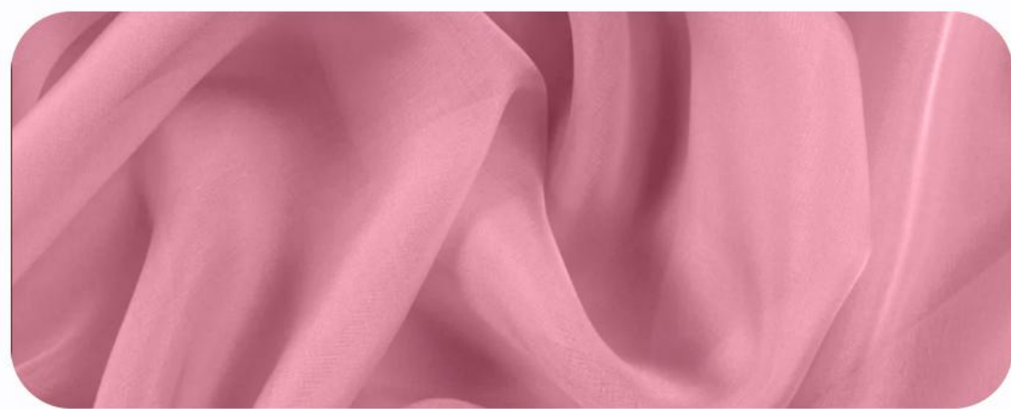
Silk Chiffon: 100% Silk.

Known for luxurious sheen and wrinkle resistance. Takes vibrant colors and prints exceptionally well. Combines soft, luxurious feel with striking visual appeal.