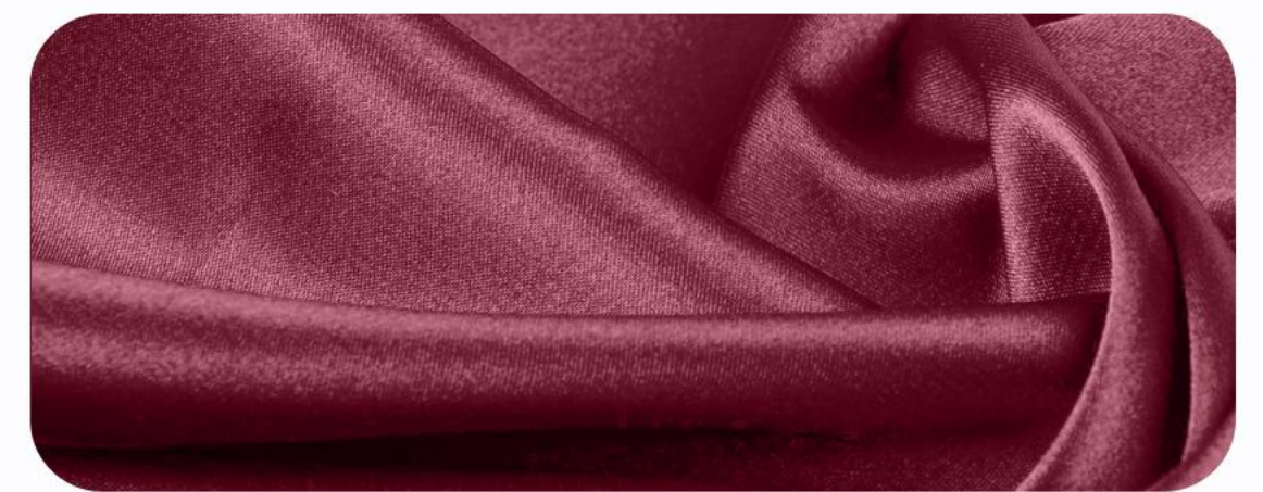
Silk Stretch Satin: 92% Silk, 8% Spandex.

Soft, semi-sheer fabric with a smooth matte finish and subtle ripple texture. Features a silky feel and fluid drape. Lightweight yet dense, ideal for various any style of summer clothing.